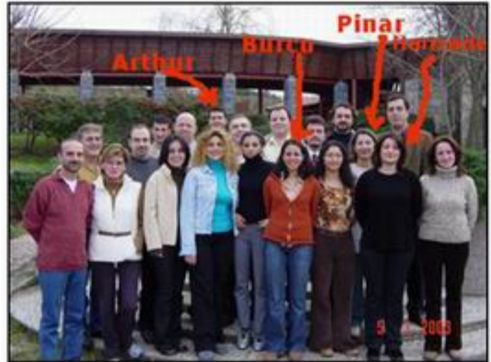
Enjoying our weekend in the annual get-together