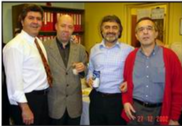
Managerial Staff of Intra cheering up in the New Year party at the head offices.